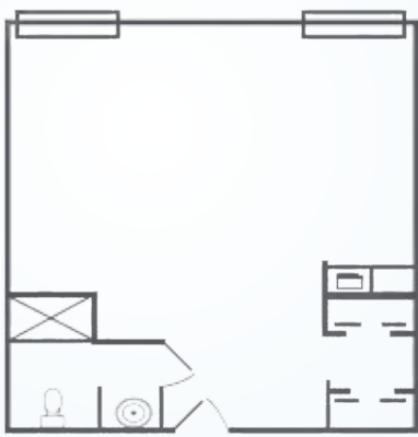
Bedroom / Living Room Kitchenette | Bath Starts at $3,600* / month 335 square feet