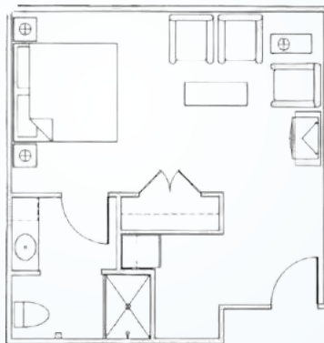
Bedroom / Living Room Kitchenette | Bath Starts at $4,200* / month 390 square feet