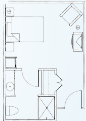
Bedroom / Living Room Bath Starts at $3,800* / month 270 square feet