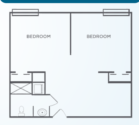
2 Bedrooms | Living Room Kitchenette | Bath Rates start at $4,600*/month